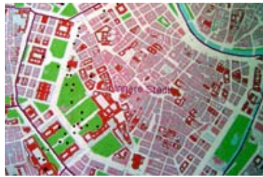
a walk through the city