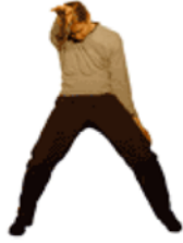
austrian national day 26.10.03