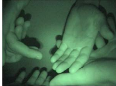
8 holes box