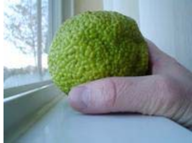
ohio orange (31/10/03)