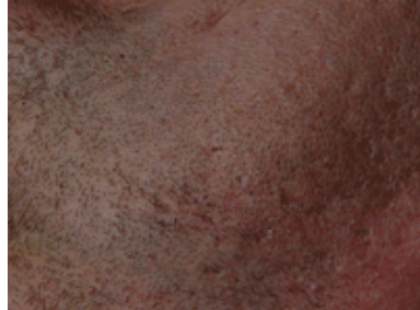
... harings (skin change)