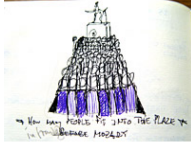
filling places with people

The sharing of methods and images for bringing work into shape. The point at which shapes become forms. Methods give rise to structures. Material is revealed when the idea hits the media... or media hits an idea.