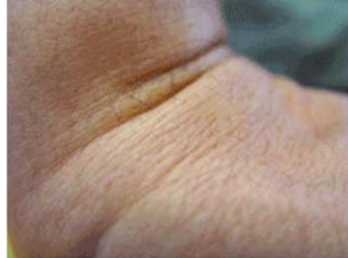
skin angles - angle's skin (skin individuality 1)