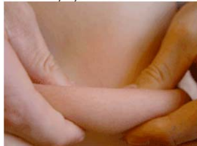
skin shelf (skin history)