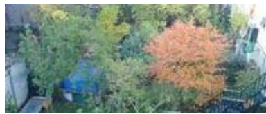
the skin of autumn (amsterdam)