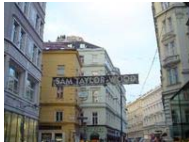
19 oct from tqw to angewandte

Auf dieser Seite finden Sie die Onlinedokumentation des Labors 'now you can have the body you (n)ever wanted', dass zwischen dem 20. und 31. Oktober 2003 in den Studios des Tanzquartier Wien und in Räumen der Universität für Angewandte Kunst in Wien stattfindet.