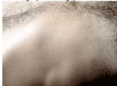
on a hairy day (skin imprints)