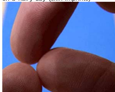
thumbs up (individuality 2)